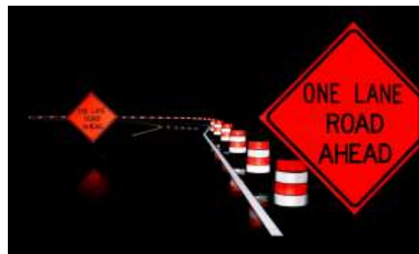
3M Stamark™ Tape and Diamond Grade™ Sheeting