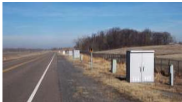
MnROAD Building, Meeting Room, Pole Barn and Roadside Cabinets

Additional facility features that may be used to support automated vehicle research include: