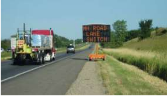
Traffic Control for I-94 Mainline/Bypass Transition