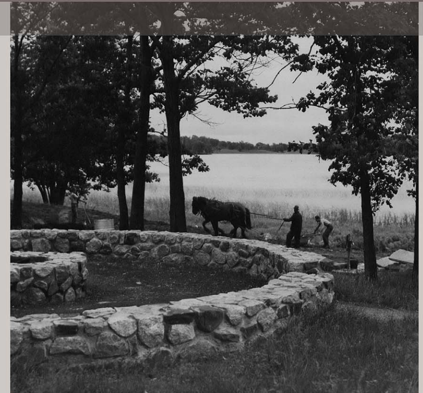
Hickory Lake stone council ring under construction by National Youth Administration workers ca. 1938

This beautiful historic landscape awaits your rediscovery.