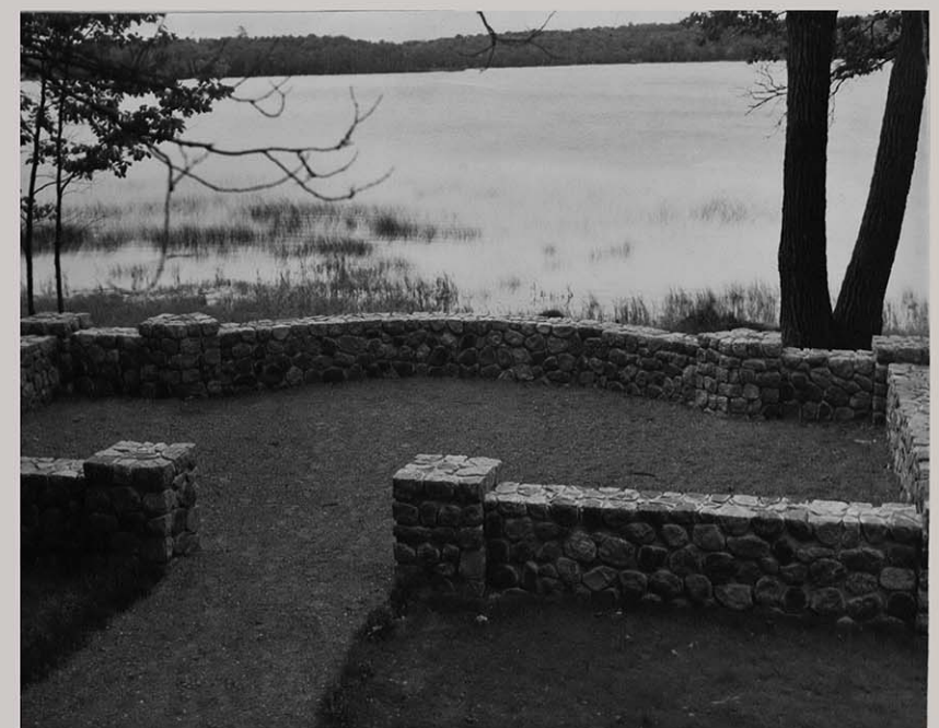
Hickory Lake stone overlook ca. 1938